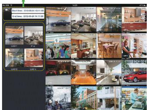
▲ Playback - Search Engine