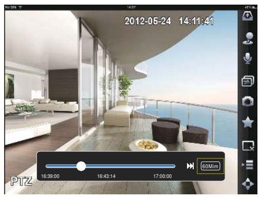
▲ Playback - Time Bar

Support Playback for different channels, devices (IPCs, domes) and period of time. That the time bar offers three selectable playback units (5 min, 30 min and 60 min) makes search more accurate and timesaving.